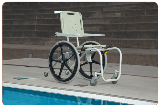
Mobile Aquatic Chair (MAC)

Mobile Aquatic Chairs are essential if your facility is using a ramp, zero-depth entry or movable floor. Additionally, Mobile Aquatic Chairs support user independence by enabling self-powered travel within the pool environment. Most traditional wheelchairs are not designed for aquatic environments and can suffer potential damage when used consistently in a pool environment. When it comes to wheelchairs, it makes good sense to have a chair that's built for your environment.